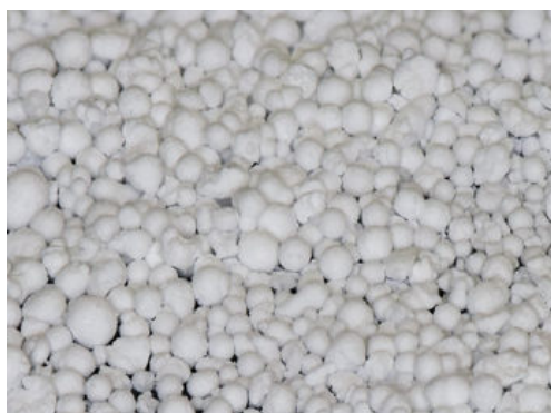
Particle Size Distribution